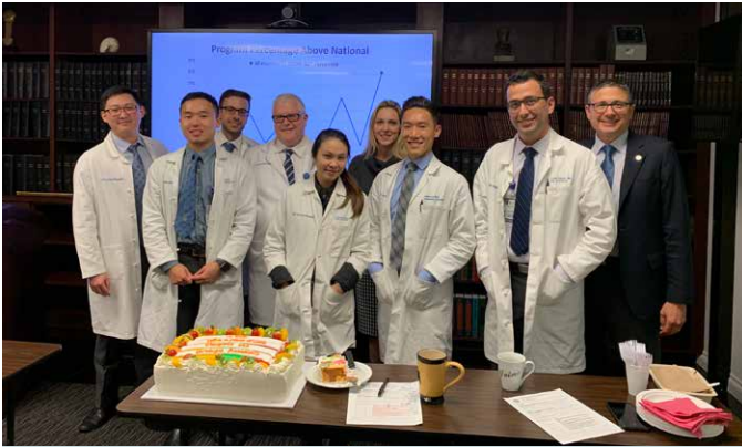
Congratulations to our UCI residents who scored 8 points above the national average on in-service examination, and thus making the examination a piece of cake.